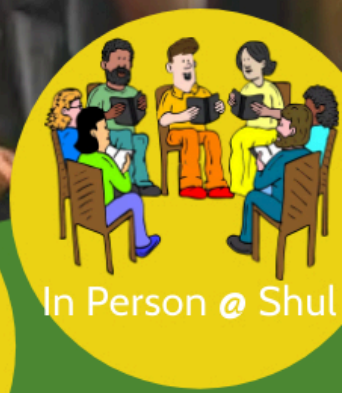
In Person @ Shul