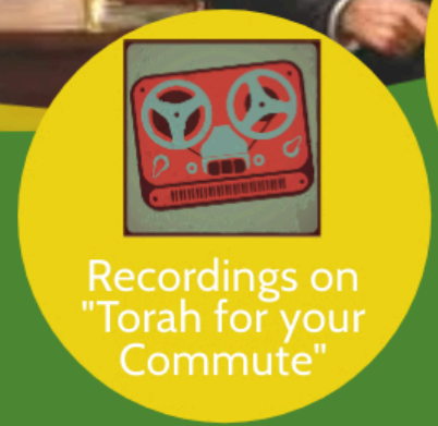
Recordings on "Torah for your Commute"

GET THE BACKGROUND UNDERSTANDING YOU NEED TO BE ABLE TO FOLLOW ALONG WITH A DAF-YOMI SHIUR OR STUDY INDEPENDENTLY (W/ ARTSCROLL)